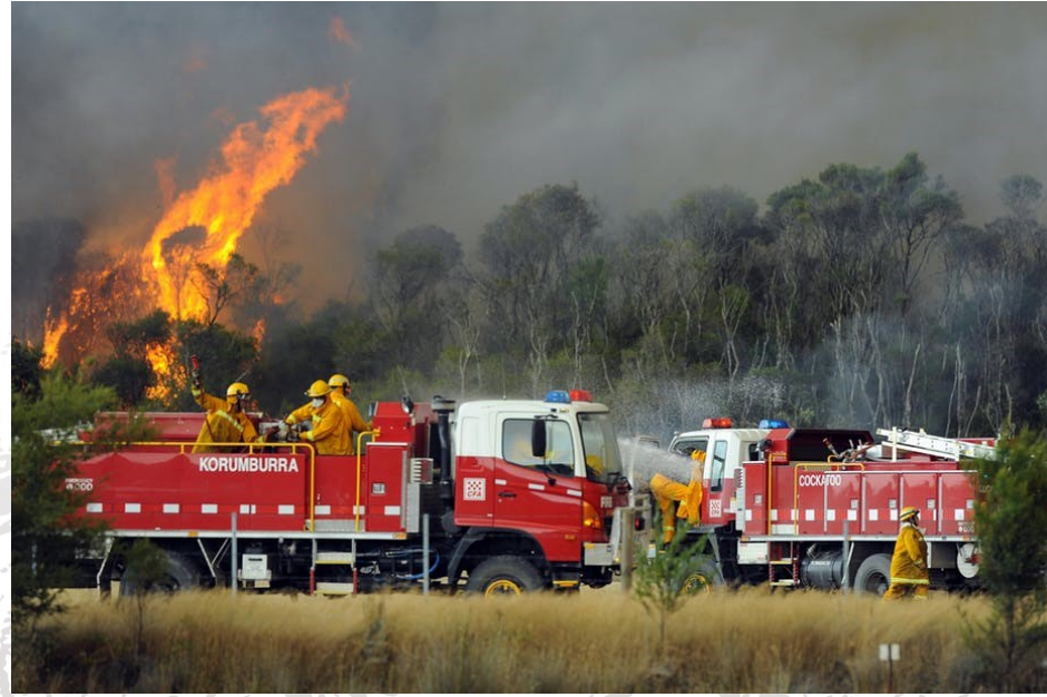
Fire fighters continue to battle the spread of bushfires in Australia

He said, "Australia is our biggest international market and it is only