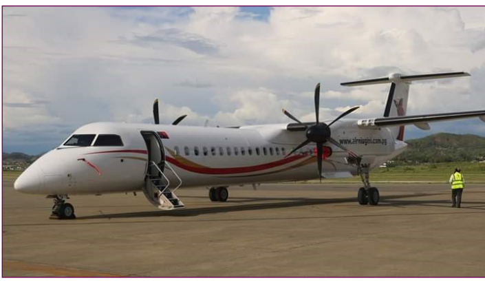
The new Q402 parked at Jackson's International Airport

50% more passenger capacity than Link PNG's present Dash 8's.