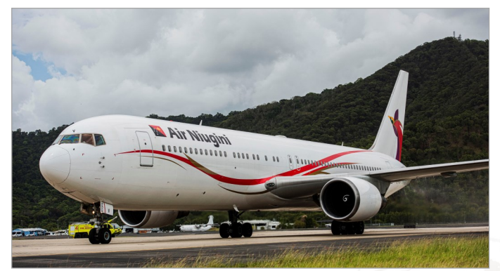
Air Niugini's flagship carrier, the B767 aircraft

A number of other Boeing customers, including Virgin Australia, have already postponed the delivery of 737 MAX jets.