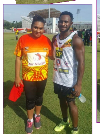
Air Niugini staff meeting SP PNG Hunters players.

team's annual sponsors engagement program on Saturday, 25th January at the Oil Search National Football Stadium here in Port Moresby.